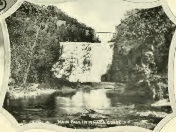
MAIN FALL IN ITHACA CORNER